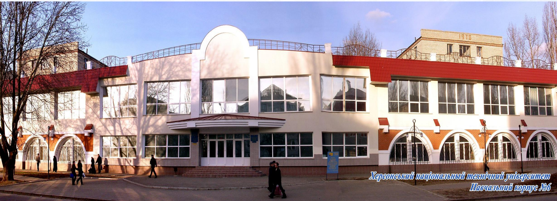
Херсонський національний технічний університет Насчальний корпус №6

This project has been funded with support from the European Commission. This publication [communication] reflects the views only of the author, and the Commission cannot be held responsible for any use which may be made of the information contained therein