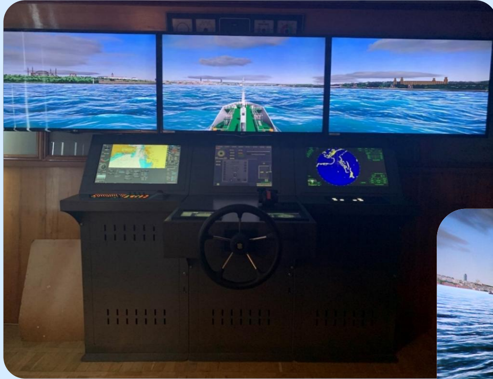
Full mission bridge simulators