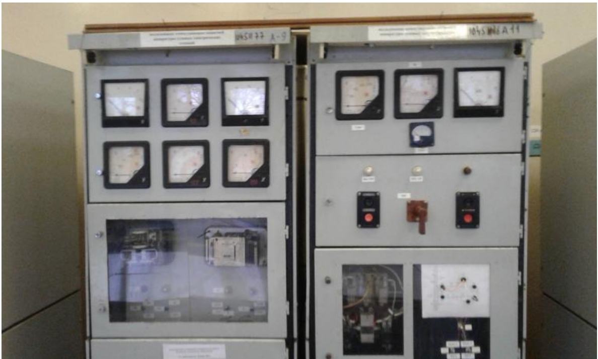
DC and AC Motor Control Systems