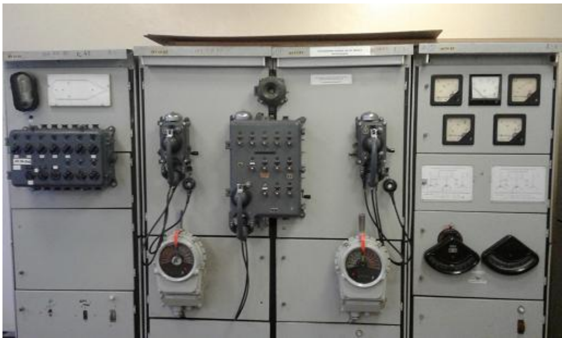
Navigation light switch, Internal telephone communication, Engine Telegraph