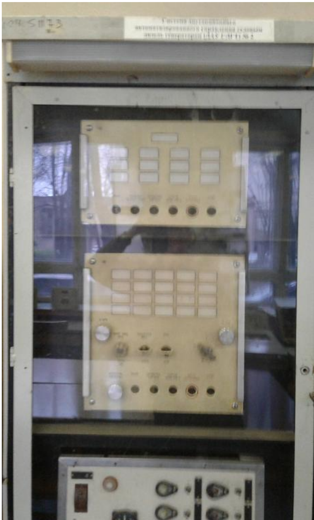
Diesel generator automated control system