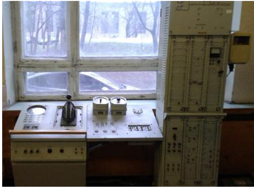
Automated Control System by the Main Engine