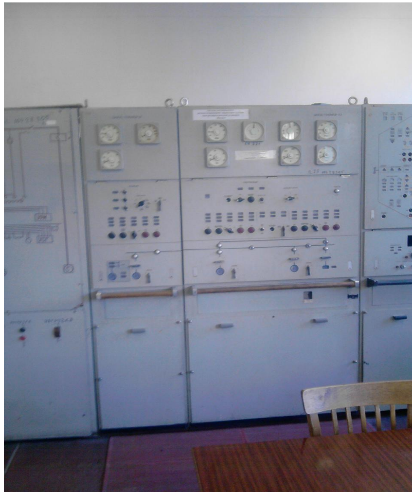
Automated control system by electrical power plant