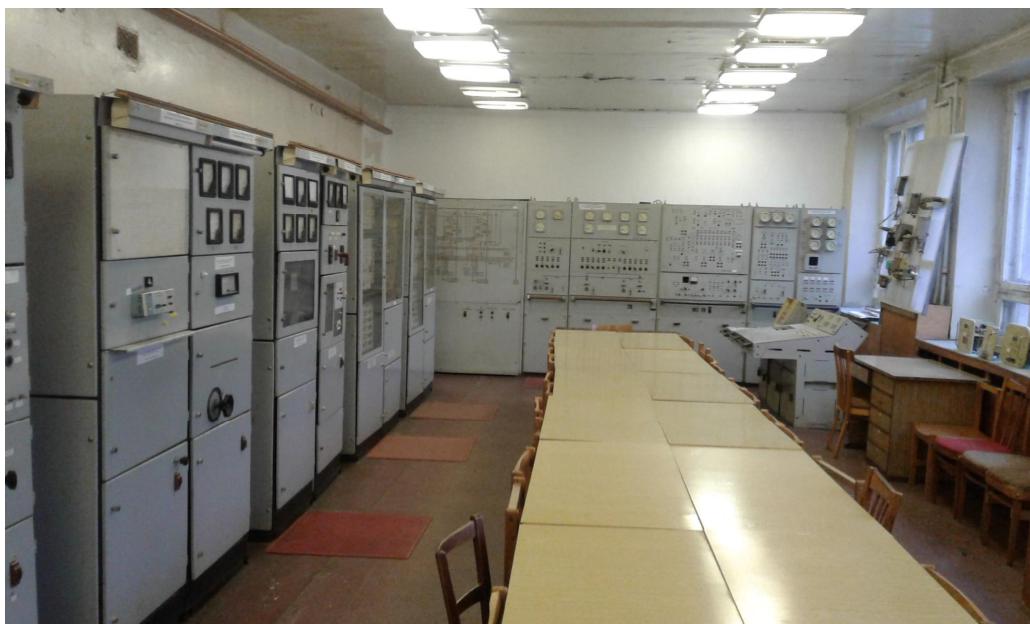
Laboratory of Ship's Electrical Equipment and Automation: