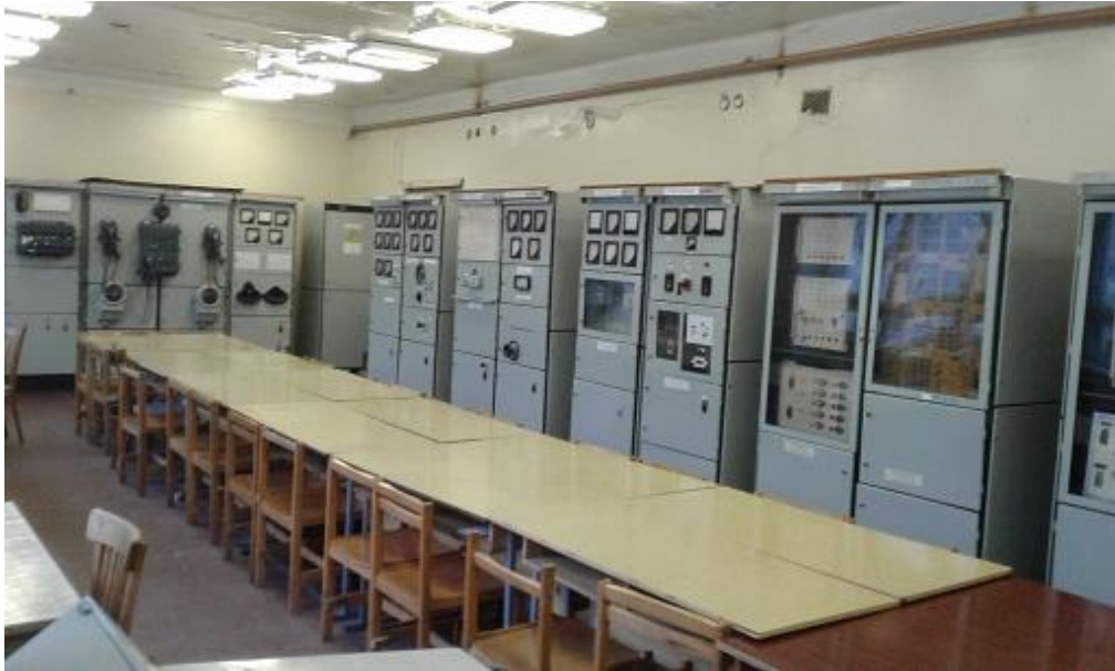
Laboratory of Ship's Electrical Equipment and Automation:

In the laboratory there are electrical equipment, control systems and electronic equipment for training electro-technical officers and engineers: Automated control system by the main engine, Autopilot, Navigation light switch, Internal telephone communication, Engine Telegraph, DC and AC Motor Control Systems, Automated control system by diesel generator, Automated control system by electric power plant, Ship power plant monitoring system