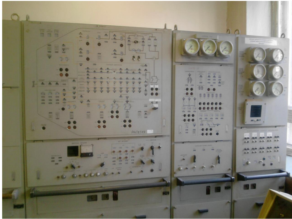
Ship power plant monitoring system