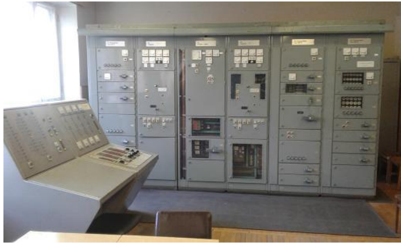
Ship electric power plant with generators, main switchboard and automatic control system