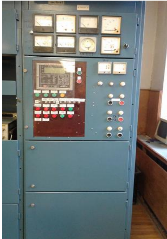
Diesel generator control system with PLC