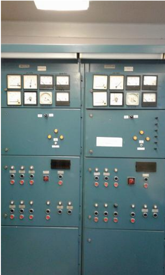
Manual synchronization systems