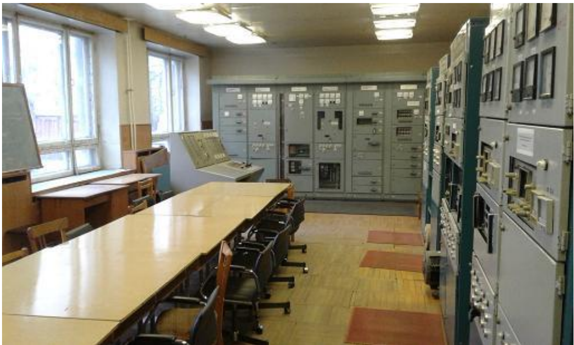
Laboratory of Ship's Automation Electrical Power plants

In the laboratory there are electrical equipment, control systems and electronic equipment for training ship electro-technical officers and engineers: Ship electric power plant with generators, main switchboard and automatic control system, Synchronous generator Self-excitation system, Battery charger, Automatic and Manual synchronization and distribution of active power synchronous generators, diesel generator control system .