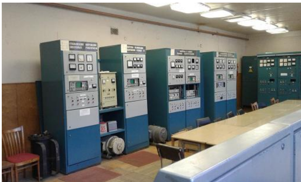
Laboratory of Ship's Automation Electrical Power plants