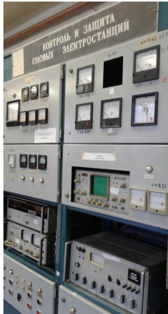
Electric generator defences