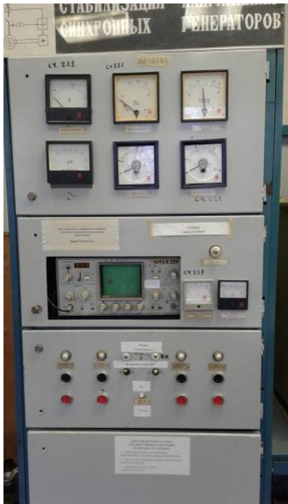
Synchronous generator Self-excitation system