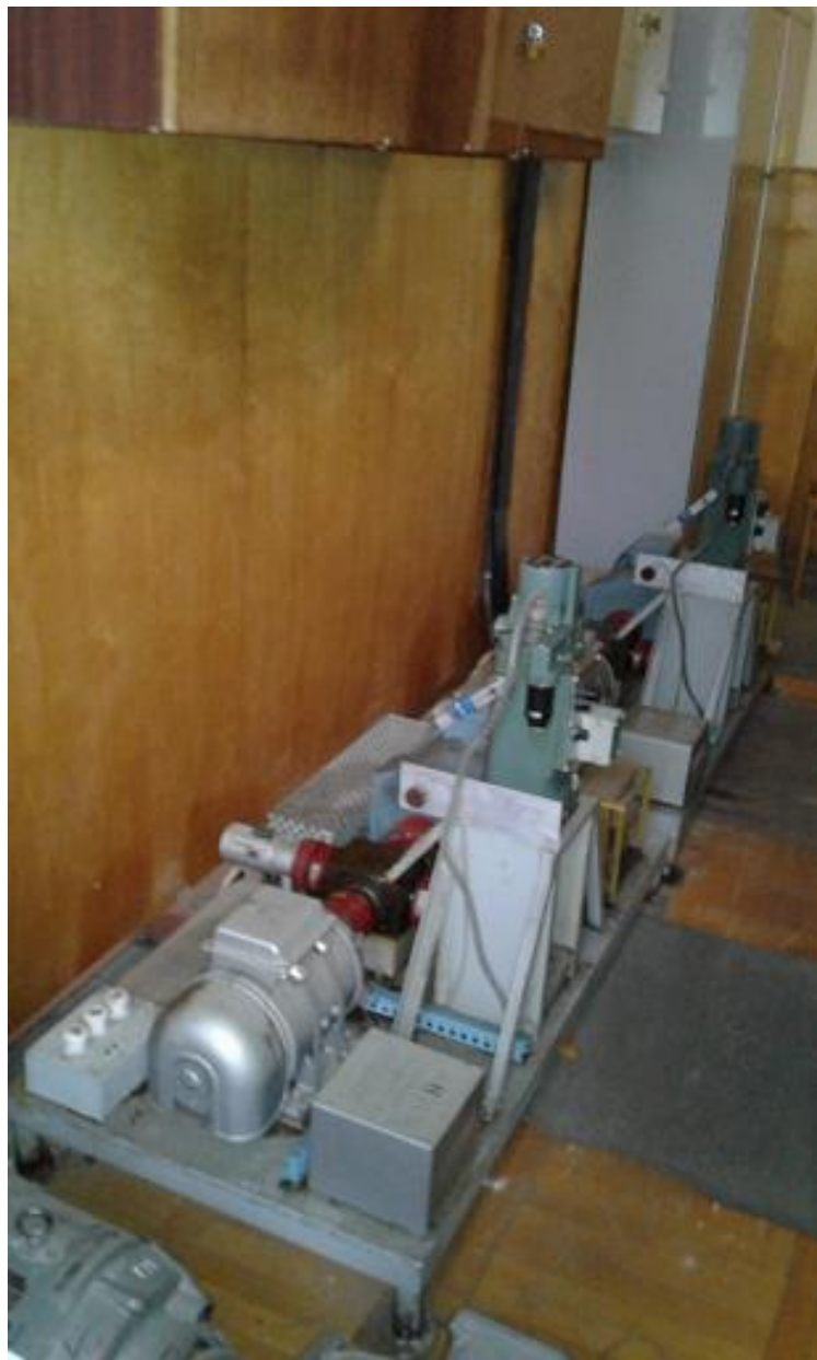
Alternators with drive engines and regulators UG-8