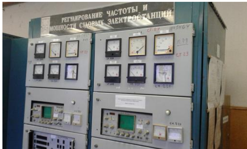
Distribution of active power synchronous generators,